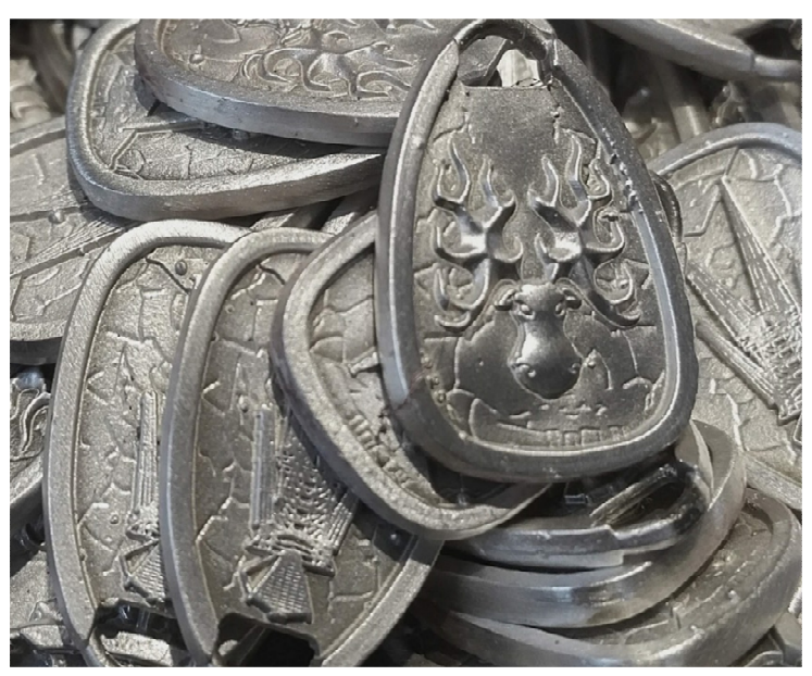
Gifted Pendants

Some of the entity infrastructure did not get brought from the storage locker including a cot and the extra fire extinguishers. During burn night we had to solicit the help of surrounding camps to distribute their fire extinguishers to ensure the participants safety.